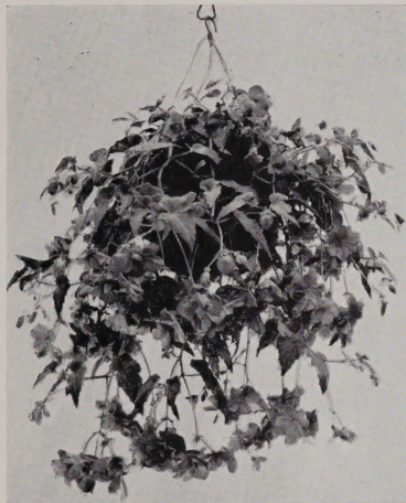
Hanging Basket Begonia Lloydii

is so different. Colors: red shades, salmon shades, and yellow shades.